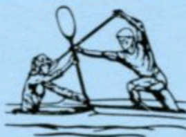
MANITOBA PADDLING ASSOCIATION

MRCA Indoor Program Bad weather kayak touring MRCA resource booklet pricing A short bird story Solo canoeing Volunteer treasurers Revision of MRCA governance documents CRCA sea kayaking school Trips and courses Books for sale Canoe and kayak trip survey log