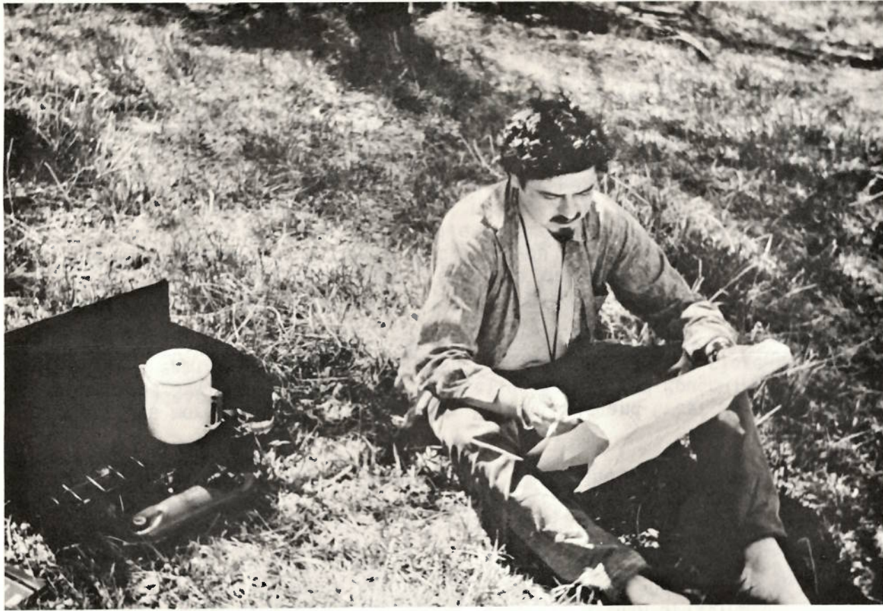
Time for coffee, and to consult the map